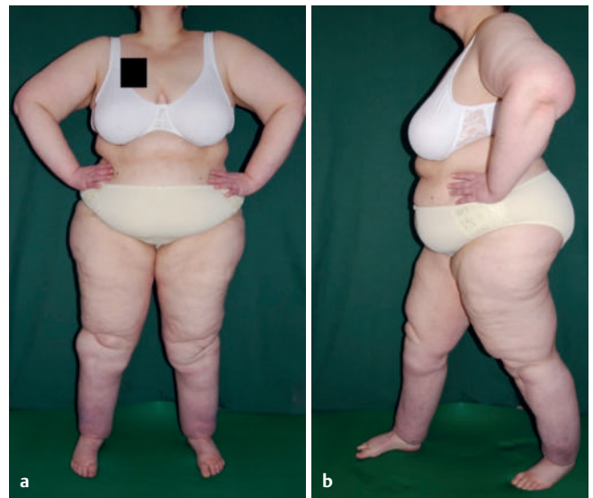
► Fig. 1 Patient who attended a large German dermatology clinic (specialising in the treatment of lipoedema).

Nearly every week in our clinical practice we see that the recommendation in the S1 Guideline Lipoedema for a “strict selection” of patients if the BMI is over 32 kg/m 2 , is merely smoke and mirrors. We regularly see severely obese patients who come to us with the intense desire for liposuction. Equally regularly, we also see however, that these morbidly obese patients have received an expert report from colleagues who practice liposuction, stating that liposuction is the only helpful option; patients with a BMI of 40, 50 or 60 kg/m 2 , patients whose report gives the diagnosis of lipoedema, but not the diagnosis of obesity. This approach is also clear in the