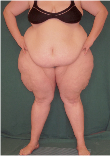
Fig. 2 Patient diagnosed with lipoedema with a severe increase in fatty tissue isolated in the thighs