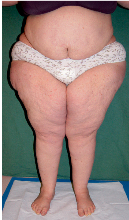
Fig. 1 Patient with lipohypertrophy of the thighs and pelvic region

This lack of objective and clear diagnostic criteria also means that no reliable figures exist on the prevalence of lipoedema. In the vast majority of cases, the lipoedema is diagnosed either by physicians with little experience in lymphology or, almost more often, by the patients themselves. In our patient population, the diagnosis of lipoedema (and, even more frequently, the diagnosis of “lipolymphoedema”) is by far the most common misdiagnosis that we encounter on a daily basis. All the figures circulating on prevalence, including those in scientific publications, are completely devoid of any evidence and are therefore not presented here (3).