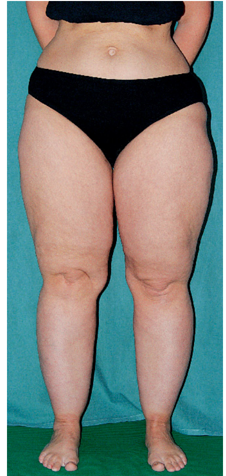
Fig. 4 Patient with lipoedema whom we have co-treated as an outpatient for approximately 10 years.

and, as a result, the lipoedema also worsens.